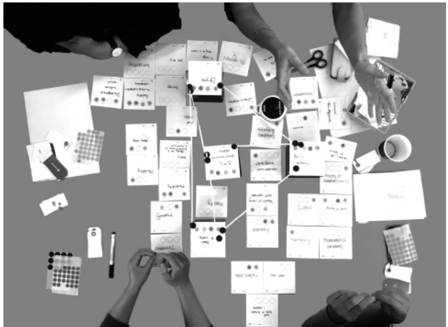
CoNavigator is a methodological tool which allows groups to collaborate on a 3-dimensional visualization of the interdisciplinary topography of a given field or theme. They can then explore possible connections between diverse areas and demonstrate how their own competencies could reinforce or drive new connections. (Photo provided.)